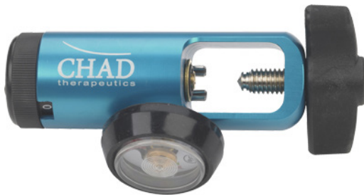
CH4808-L-BLUE 870 Regulator